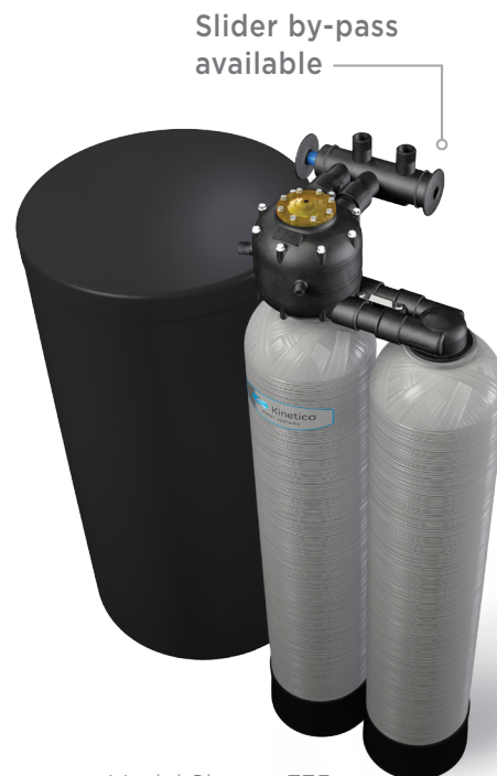
Model Shown: 735

5 Year Limited Warranty: Rest assured, we stand behind our products.