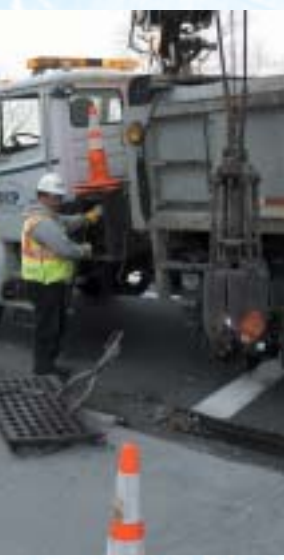
Catch Basin Cleaning

Approximately 70% of New York City's sewer system is combined, with sanitary and storm flow moving through the same mains. Usually, both sanitary sewage and storm water are carried by the sewer system to one of the City's 14 wastewater treatment plants. During periods of significant rainfall, however, the combined flow of sanitary and storm water can be greater than the capacity of the treatment plants; when this occurs, untreated wastewater may be released from the sewer system into local water bodies.