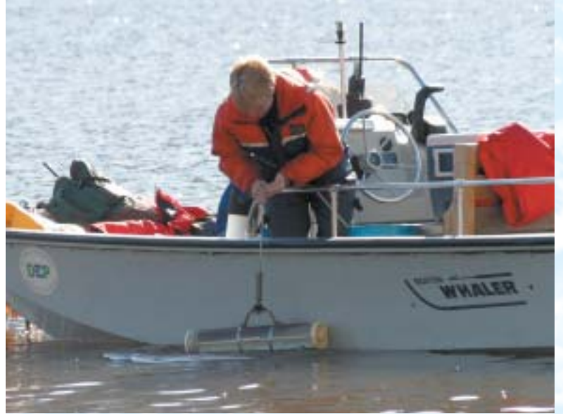
Drinking Water Quality Control Limnological Monitoring