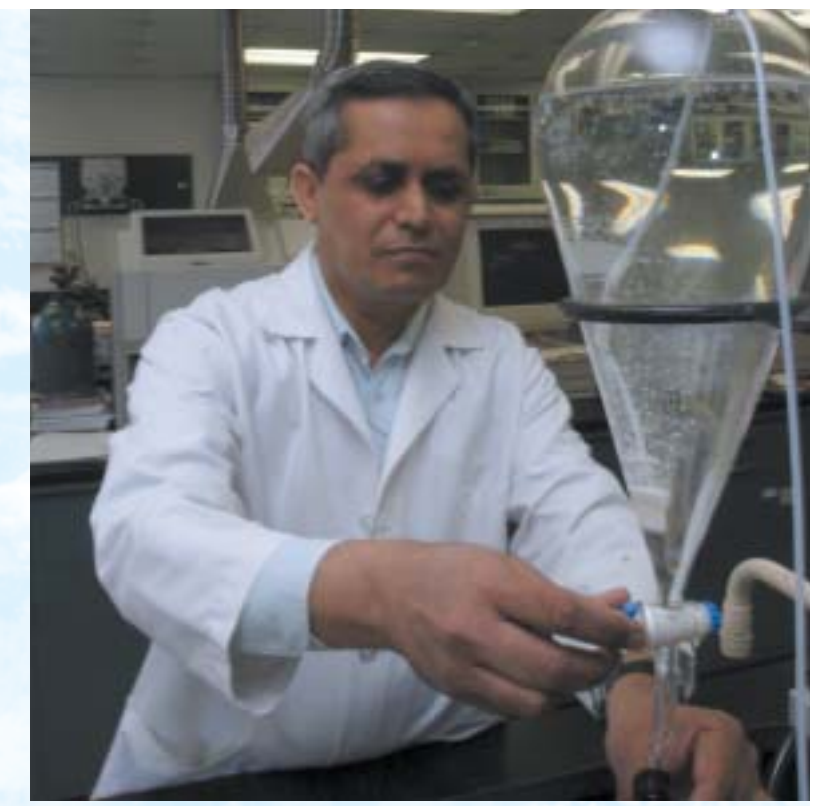
Drinking Water Quality Control Distribution Laboratory - Organics

plaints graphically, improve the scheduling and productivity of work crews, and accelerate the planning of capital upgrade and expansion work. Trenchless technology is the application of epoxy or resin inside an existing water or sewer main. This process rehabilitates the main at a significantly reduced cost and enables DEP or DDC to perform repair work without extensive street trenching.