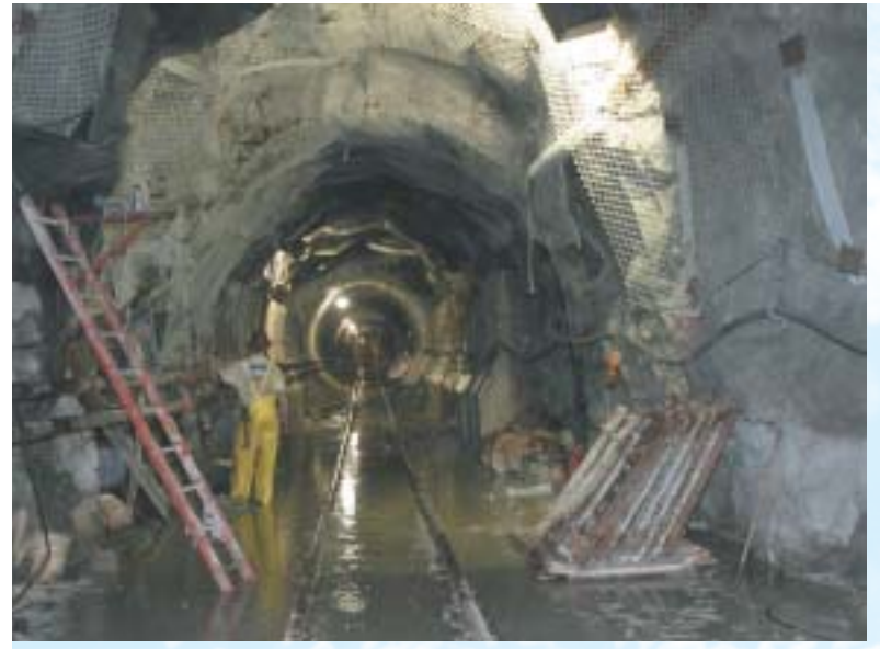
Tunnel No. 3 Construction