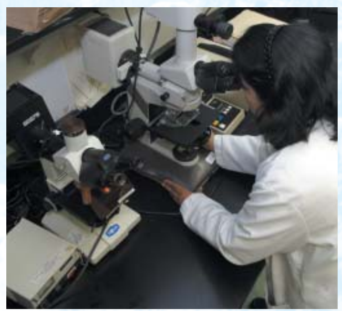
Drinking Water Quality Control Distribution Laboratory - Microscopy

In 1992, the City started a comprehensive program to monitor its source waters and watersheds for the presence of Cryptosporidium and Giardia . Since then, samples have been collected weekly from the outflows of the Kensico and New Croton Reservoirs, before water is first chlorinated in the Catskill/Delaware and Croton Systems, respectively. Since 1992, DEP has modified its laboratory protocols twice to improve the Department's ability to detect both Giardia cysts and Cryptosporidium oocysts. These test methods, however, are limited in that they do not allow us to determine if organisms identified are dead or capable of causing disease.