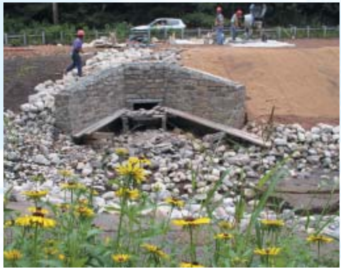
Staten Island Bluebelt Restoration And Beautification

The Staten Island Bluebelt system provides ecologically sound and cost-effective storm water management by