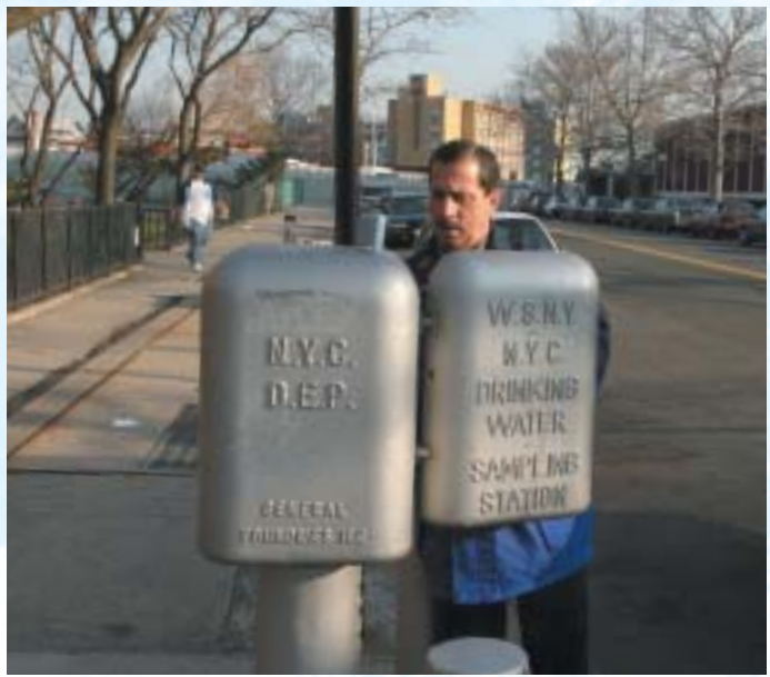
Drinking Water Sample Collection at Sampling Station

DEP conducts most of its distribution water quality monitoring at approximately 1000 fixed sampling stations throughout the City. These stations, which you may have seen in your neighborhood, allow samples to be collected throughout the distribution system in an efficient and sanitary manner.