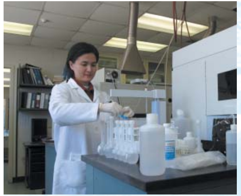
Drinking Water Quality Control Distribution Laboratory - Metals Analysis