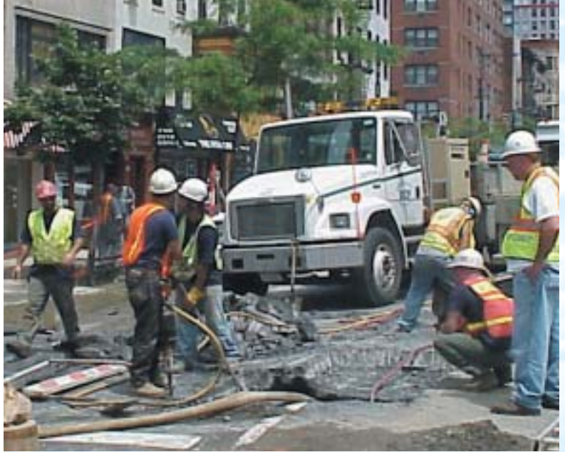
Water Main Break Repair