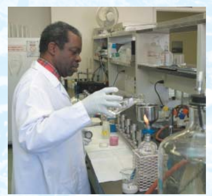
Drinking Water Quality Control Distribution Laboratory - Microbiology

In 2003, a total of 141 samples of Kensico Reservoir effluent and 59 samples of New Croton Reservoir effluent were collected and analyzed for Giardia cysts and Cryptosporidium oocysts using Method 1623 HV. Of the 141 Kensico Reservoir samples, 109 were positive for Giardia and 41 were positive for Cryptosporidium . Of the 59 New Croton Reservoir samples, 30 were positive for Giardia and 7 were positive for Cryptosporidium . DEP's Giardia and 7 were positive for Cryptosporidium . DEP's Giardia and Cryptosporidium data from 1992 to the present, along with weekly updates, can be viewed on our web site at www.nyc.gov/dep/html/pathogen.html. As mentioned, detecting the presence of Giardia cysts and Cryptosporidium oocysts does not indicate whether these organisms are dead or potentially infectious.